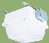
VR4C & VR4CV