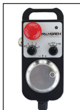
User-friendly portable handwheel