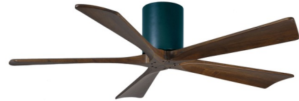
Shown in matte black / walnut tone

The Atlas Irene Hugger Ceiling Fan is rustic yet strikingly modern, with cleanly joined solid wood blades and a minimal cylindrical motor housing. Its streamlined profile with the warm, natural look of wood works beautifully in contemporary and transitional spaces. Equipped with a DC motor, the fan is energy efficient and ultra-quiet. A hand-held remote control and wall control are included, both able to turn the motor on/off and set 6 speeds and forward/reverse. For fans that have a light, the controls also turn the light on/off and dims it. Fans that have a light include a cap matching the housing finish for no-light use. Note: Some combinations of motor finish, blade color, and light option are not available. The 72 inch is available in a 3-blade only and is not available with a light option.