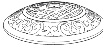
B. Base 1 pc.