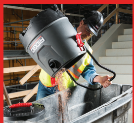
MOTOR ON BOTTOM