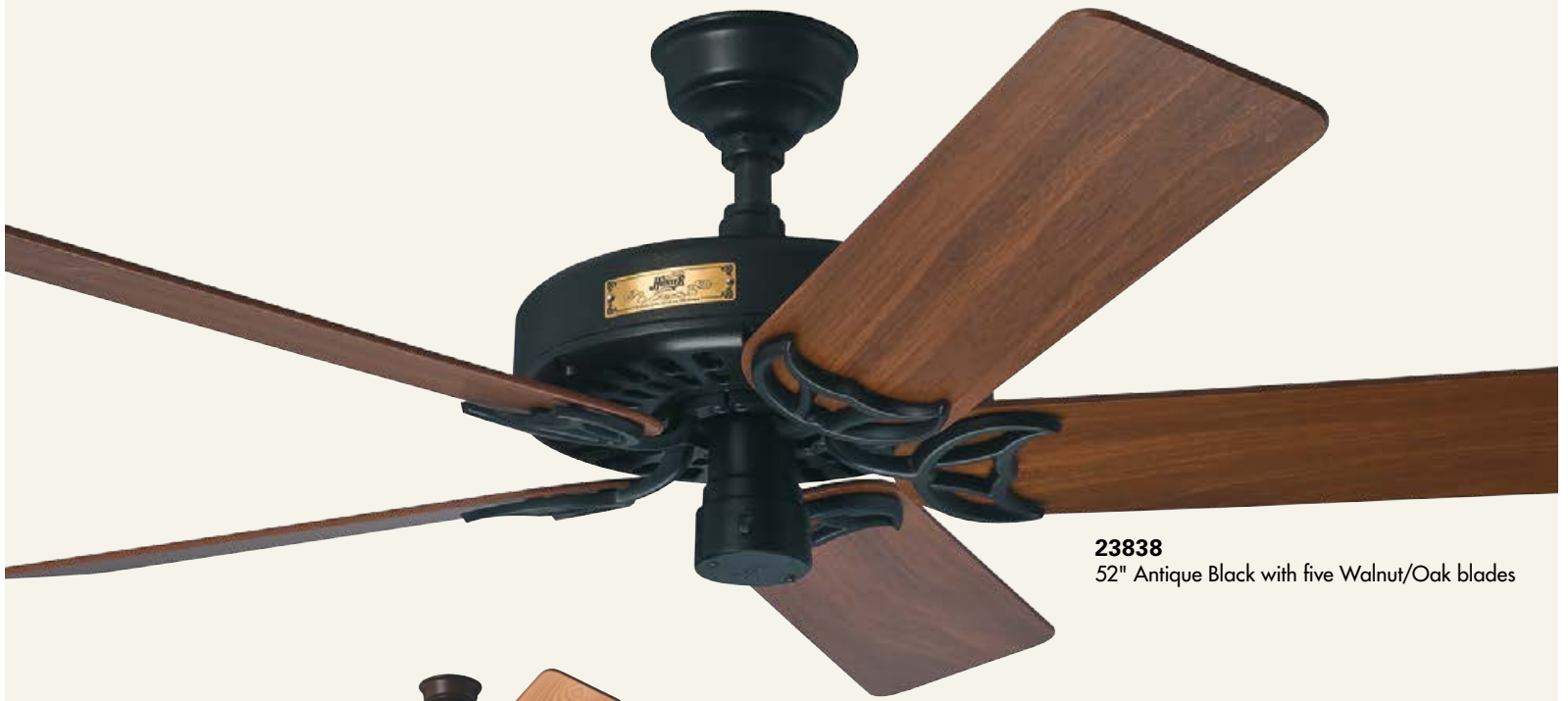
23838 52" Antique Black with five Walnut/Oak blades