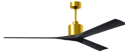
Shown in brushed brass / matte black