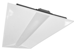
T4A Architectural LED Troffers