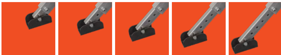
Five adjustable leg lengths to assure stable footing on uneven ground