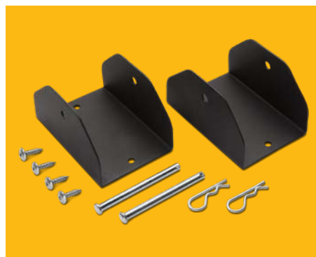
Optional garage storage brackets (sold separately) for keeping the step in a clean environment when not in use