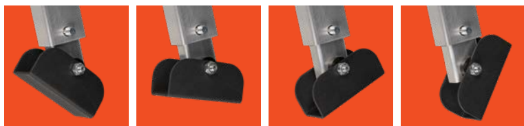
Pivoting foot pads for enhanced ground contact