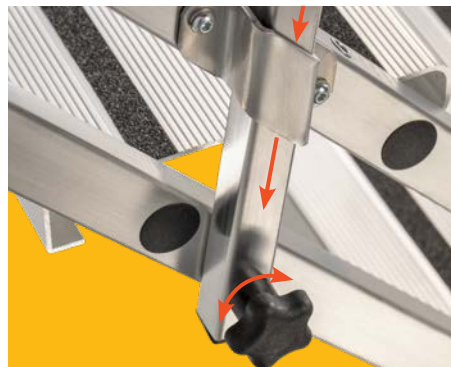
Includes handrail for extra stability while using the steps