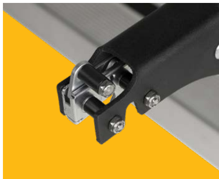
Quick-release levers allow for easy detachment and storage