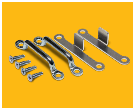
Included hardware kit for easy mounting to your patio or deck ramp