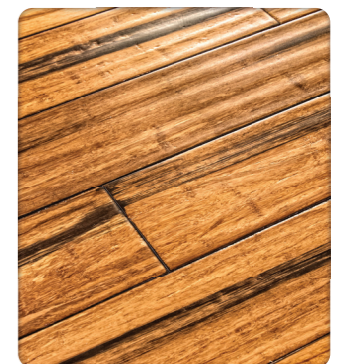
Uneven Wood Floors