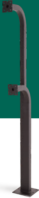
Dual Height Pad Mount 1200-049