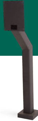
Offset Pad Mount 1200-037 In-Ground Mount 1200-038