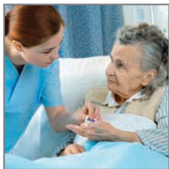
Assisting patients with hand hygiene