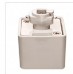
H System Adapter