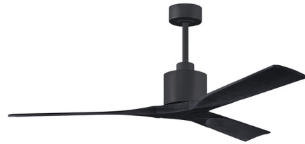
Shown in matte black / matte black