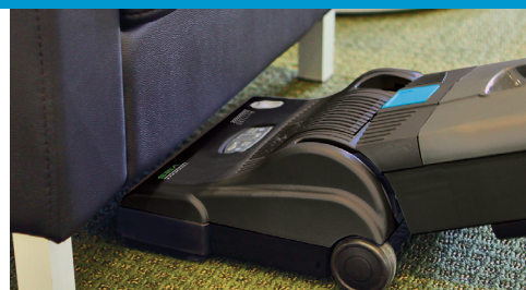
Flat-to-Floor for Easy Cleaning