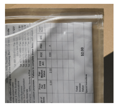
Tough construction resists moisture and abrasion. Available in two sizes, 8.5" \times 11.5" or 10" \times 12.5" .

Makes for easy document inspection. Zipper closure opens easily and closes securely. Perfect for cross border shipping. Holds bulky items or multiple documents.