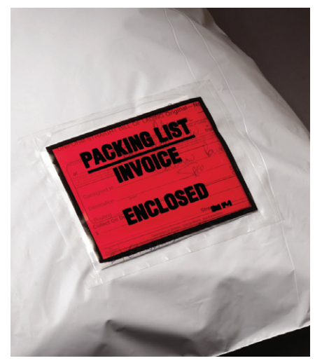
Secure adhesion — high tack, pressure sensitive adhesive on the back of the envelope grabs on contact and holds securely.