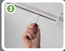
Attach track to ceiling.