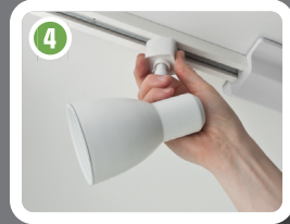
Simply twist heads onto track.