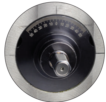
Angles left or right up to 50° in 1° increments