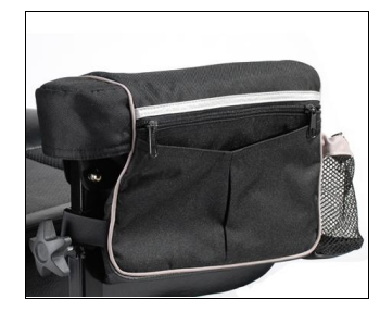
Armrest Bag Part#: AB1010