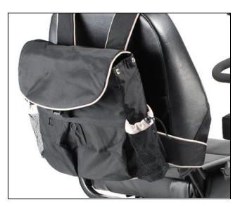
Backpack Part#: AB1120