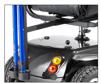
Crutch/Cane Holder Part#: SF8030