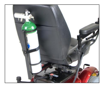
Oxygen Tank Holder Part#: SF8010

Add functionality and convenience to your Drive scooter with these options and accessories. Contact your authorized Drive Medical provider or visit www.drivemedical.com for more information.