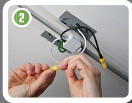
2 Connect track to mounting plate and wire.