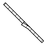
CUTAWAY VIEW B-B