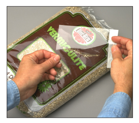
3M<sup>™</sup> Tape Sheets 822