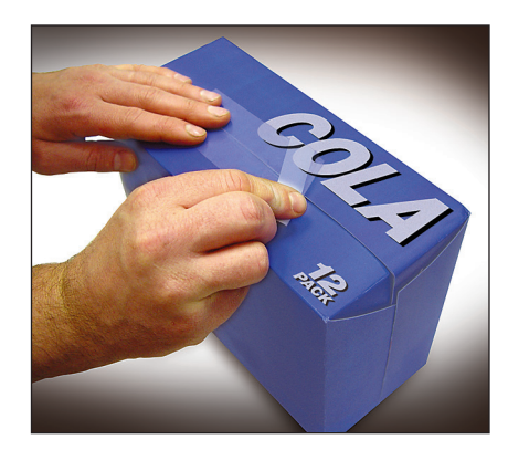
3M™ Packaging Tape Pad 3750P