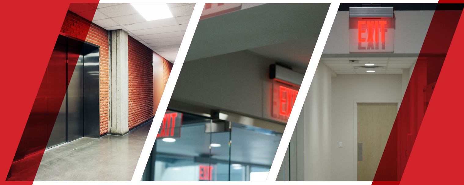
The EXL series can be installed in many applications such as doorways, hallways, warehouses, etc.