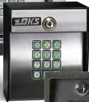
1506 surface mount