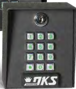
1515 surface mount