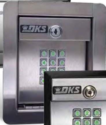
1506 flush mount with lighted keys