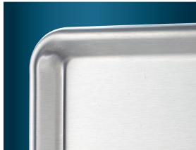
Tapered sides for compact storage