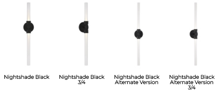
Nightshade Black 3/4

To view all available finish options, please visit techlighting.com