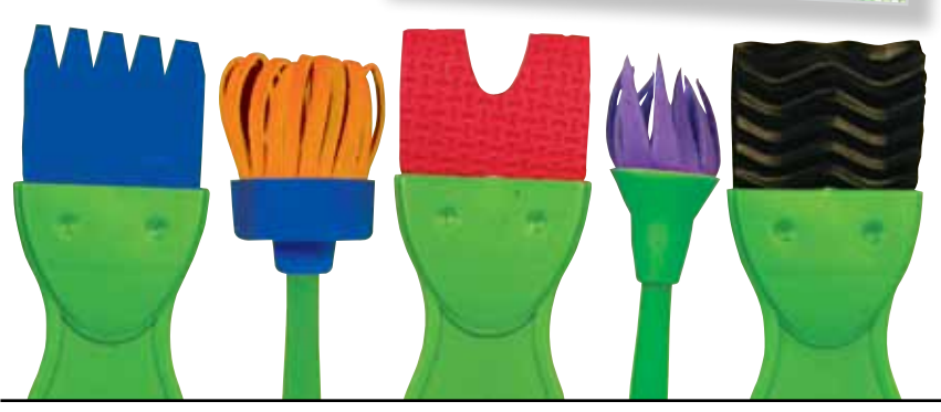
YOUNG ARTIST TEXTURE PAINTING SET #14513 © Faber-Castell USA, Inc. • Cleveland, Ohio 44125 www.fabercastell.com Designed in USA - Made in China • Conforms to ASTM D-4236 • Non-toxic Safe for children

You can also make realistic art like landscapes, flowers a house or a bug. Almost anything your imagination can dream up is possible.