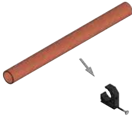
SNAP PIPING THROUGH CLAMP. (FIG. 1)