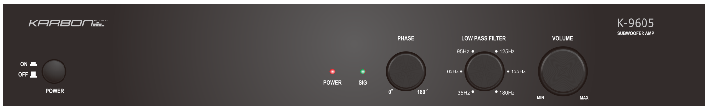
Diagram 3 Amplifier Front Panel

This control allows you to match the arrival times of the sound waves from the subwoofer and the main speakers to your listening area. While the system is playing flip the switch to the 180° setting and back to 0° until the bass sounds louder or less boomy. Depending on the subwoofers placement and room acoustics, this control may have little or no effect.