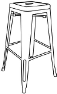
SEAT QTY 1