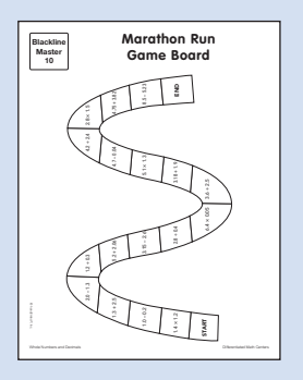
Blackline Master #10