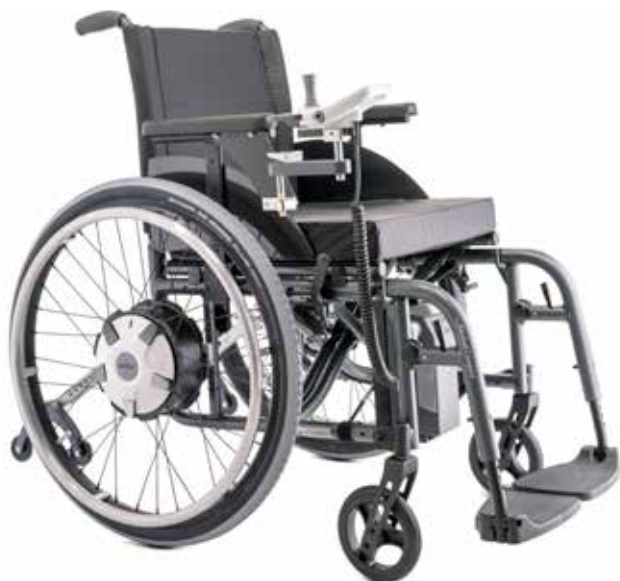
e-fix E36: powerful drive wheels with more power (optional)