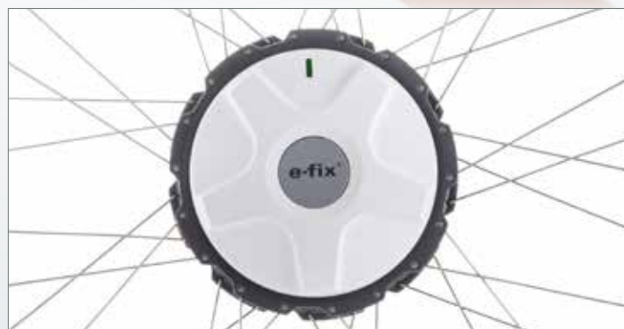
Compact, light, powerful: the e-fix drive unit