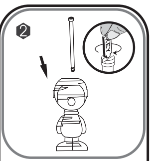
After piece #32, insert the center pole #33 and screw it down with the key enclosed. Then, cover the pole with #34.