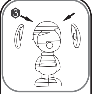
After the body is assembled, insert the ears into the head.