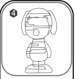
Sticker the eyes and back with the stickers enclosed.