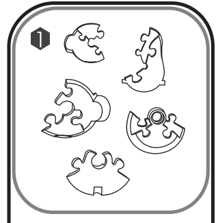
Do not lose any puzzle pieces.