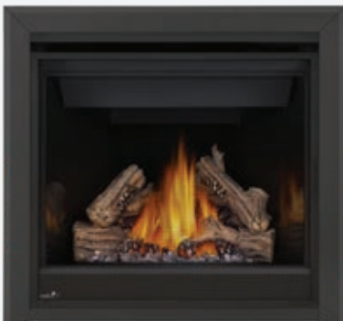
3" Premium Bevelled Trim