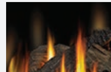
MIRRO-FLAME™ Porcelain Reflective Radiant Panels