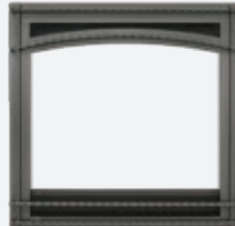
Wrought Iron Decorative Surround