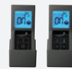
Convenient Remote Control