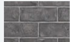
Westminster™ Standard Decorative Brick Panel