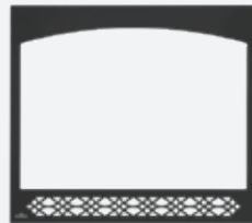
Black Heritage Decorative Safety Barrier