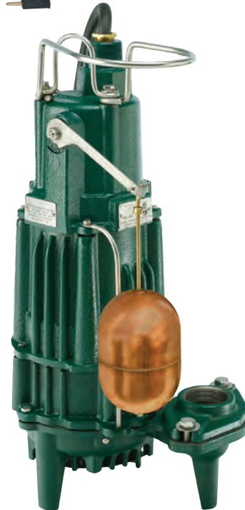
Explosion-proof models available