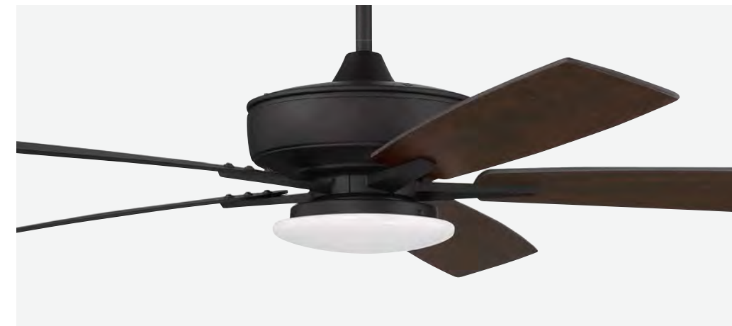
Espresso S112ESP5-60ESPWLN Reversible Espresso + Walnut Blades