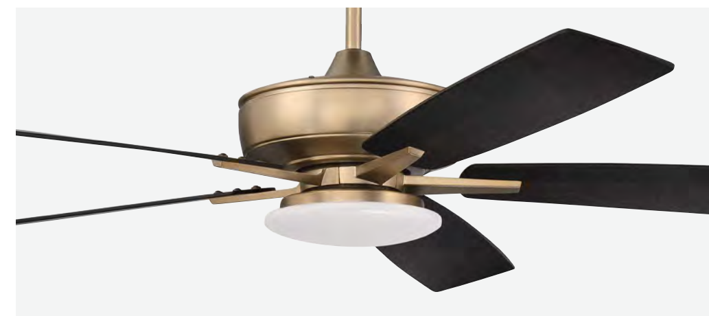
Satin Brass S112SB5-60BWNFB Reversible Black Walnut + Flat Black Blades