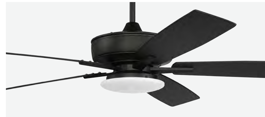
Flat Black S112FB5-60FBGW Reversible Flat Black + Greywood Blades