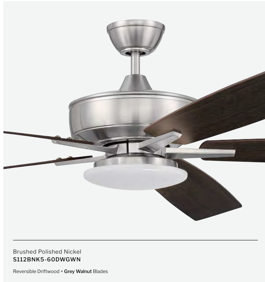
Brushed Polished Nickel S112BNK5-60DWGWN Reversible Driftwood + Grey Walnut Blades