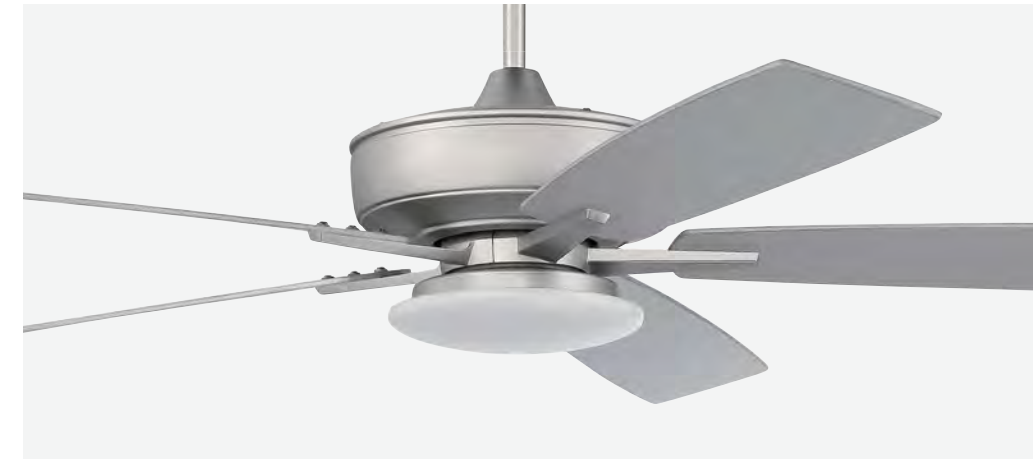
Brushed Satin Nickel S112BN5-60BNGW Reversible Brushed Nickel + Greywood Blades