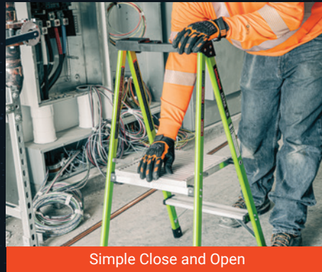
Simple Close and Open