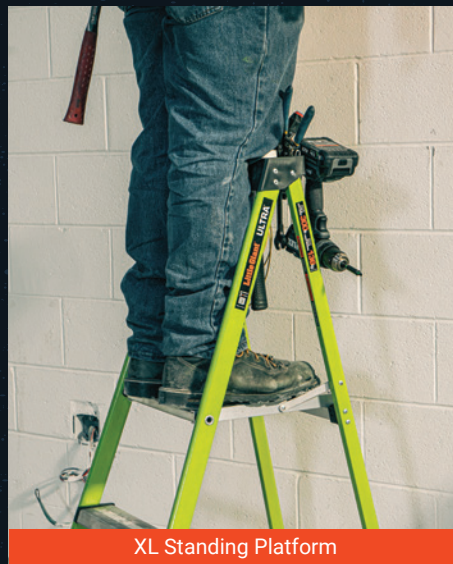
XL Standing Platform