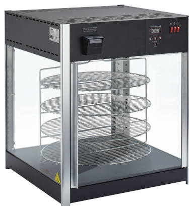
EDM-1K (Single Door)