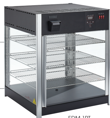
EDM-1PT (Double Door)