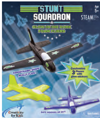
STUNT SQUADRON GLOW-IN-THE-DARK FOAM FLIERS #6437000

HAVING FUN? TRY OUT ANOTHER KIT FROM CREATIVITY FOR KIDS