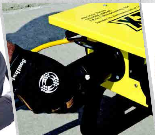
CONNECT TO X-TREME BOX™ PRODUCTS