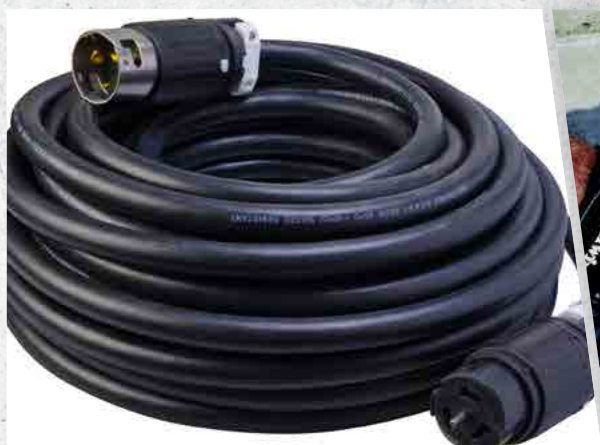
19390008 WITH PREMIUM HUBBELL CONNECTORS