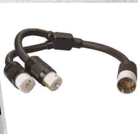
19200008 MOLDED “Y” CORDSET