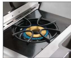
Range Side Burner