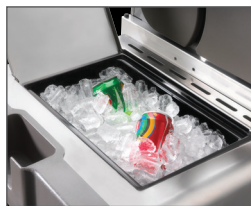
Integrated Ice / Marinade Bucket