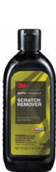
3M™ Scratch Removal PN 39044