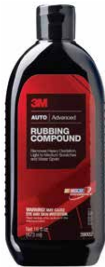
3M™ Rubbing Compound PN 39002 or PN 03900