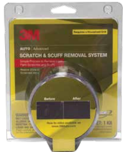
3M™ Scratch Removal Kit PN 39071

3M™ Trizact™ Abrasives for Effective Scratch/Scuff Removal