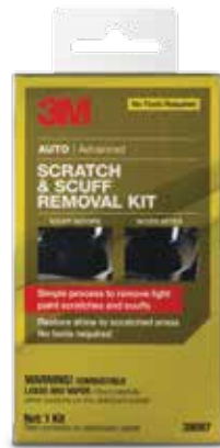
3M™ Scratch & Scuff Removal Kit PN 39087

3M™ Trizact™ Abrasives for Effective Scratch/Scuff Removal