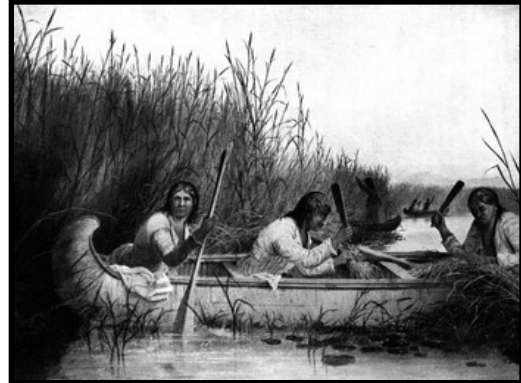
Women in canoe gathering wild rice

Indians in the Great Lakes region also harvested maple tree sap to make syrup and sugar to sweeten their foods. Children helped their mothers cut gashes in the bark of maple trees which allowed the sap to drip into a wooden trough. The sap was boiled for syrup or hardened to form sugar.