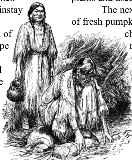
Women drawing water from stream

In the next topic, we will explore Indian family life before America was settled by Europeans.