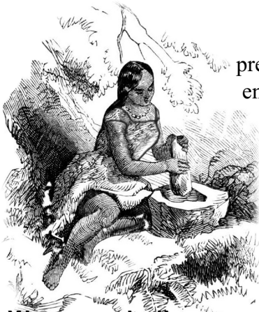
Woman grinding corn

stones. The cornmeal was either boiled to make a thick porridge or baked into pancakes and served with meals, similar to the way we eat bread and rice today. Hominy was also