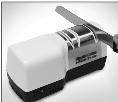
Figure 5. Serrated knife in Stage 2.

Do not sharpen in the Hybrid® any single sided, single faceted Asian Kataba knives, such as the traditional sashimi styled blade that is commonly used to prepare ultra thin sashimi. Stage 2 sharpens simultaneously both sides of the cutting edge while the sashimi knives are designed to be sharpened only on one side of the blade. The Chef'sChoice electric sharpeners listed in the previous paragraph will correctly sharpen these single sided knives.