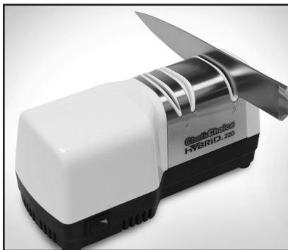
Figure 4. Knife in Stage 2. Use back and forth sharpening strokes with modest downward pressure. See text.