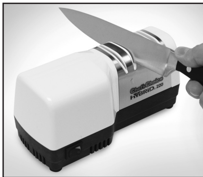
Figure 3. Inserting the blade in the right slot of Stage 1. Alternate pulls in left and right slots.

To resharpen follow the procedure for Stage 2 described above, making two to three (2-3) complete back and forth stroke pairs while maintaining recommended downward pressure. Listen to confirm the sharpening disks are turning. Then test the edge for sharpness. If necessary resharpen again but first use Stage 1 followed by two to three (2-3) back and forth pairs of strokes in Stage 2. Generally you should be able to resharpen several times using only Stage 2 before having to resharpen in Stage 1.