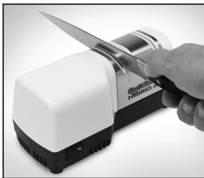
Figure 1. Inserting the blade in the left slot of the Stage 1. Alternate individual pulls in left and right slots.

Figure 2 illustrates how to check for the burr. Proceed as follows: If your last sharpening pull was in the right slot there should be a small burr on the right side of the blade edge. If the last pull was in the left slot there should be a small burr along the left side of the edge. If there is no burr make another pair of pulls and again check for a burr. Repeat making pairs of