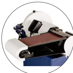
Belt arm adjusts vertically, horizontally and any position in-between