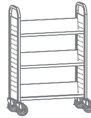
46.25"H x 30.75"W x 13"D