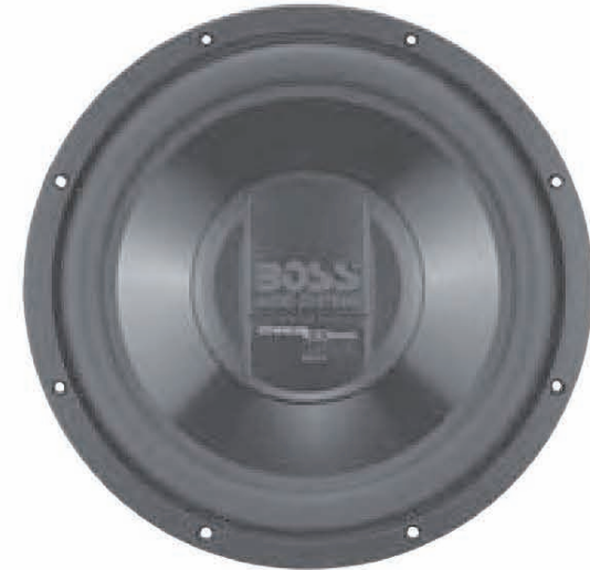
CX124DVC 12" (30.5cm) Subwoofer