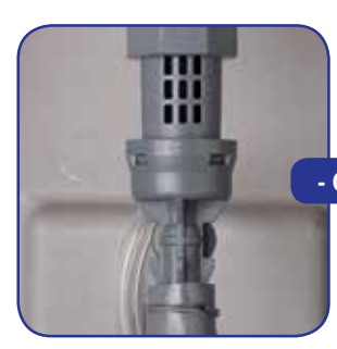
E-Gap eductors with Backflow Prevention built-in on each product station.