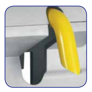
Spray bottles fill at 1 gallon per minute. Angled hose is safer for users and reduces foam.