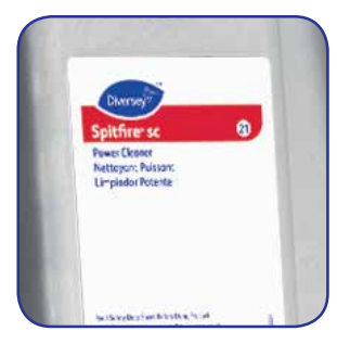
Button labels are colorcoded & numbered for easy identification.