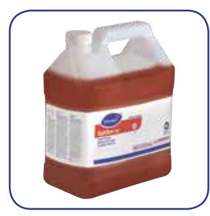
1.5 gallon kegs of concentrated chemical are cost-effective.