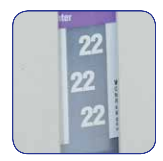
Easy product identification of 1.5 gallon kegs of superconcentrates.