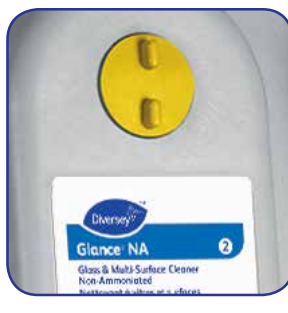
Hose-fill button locks on for hands-free filling.