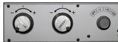
Manual hand jog for ease of operator use