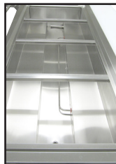
304 Stainless Steel Water Pan Well