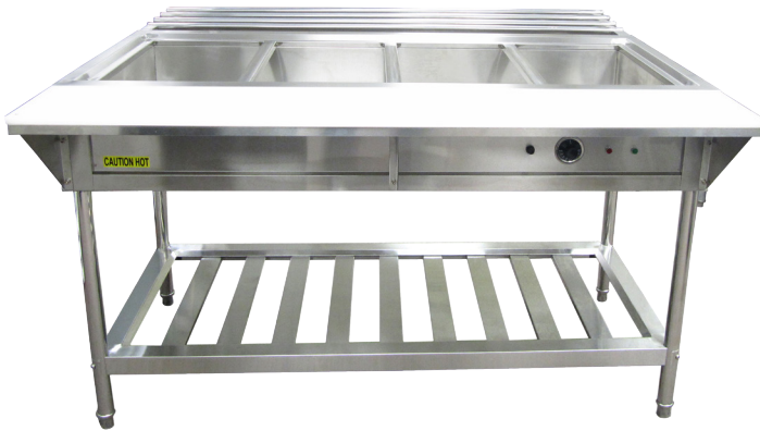
EST-240 - 4 BAY Shown with optional cutting board and tray holder