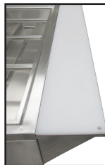
EST-240/PCB 9" Cutting Board